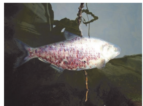
Figure 4. Fish with signs of VHS in Lake St. Clair.