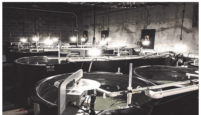
Figure 2. Walleye rearing room at the Blue Jay Creek Fish Culture Station.

For more information about aquaculture research in Canada, please see the 2017 Canadian Aquaculture R&D review available online: http://tiny.cc/CanAquaRD