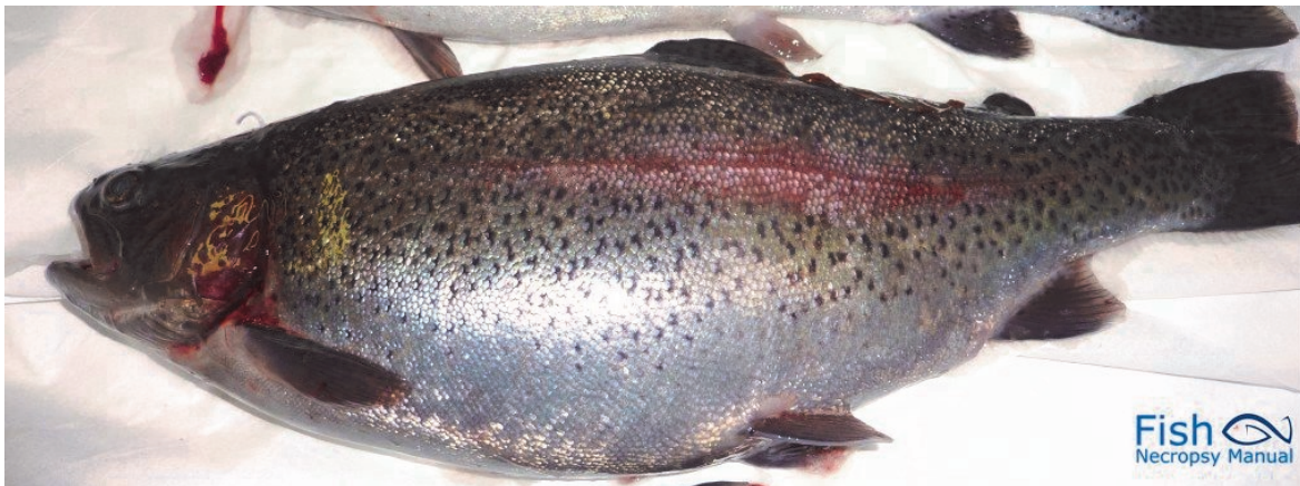
Figure 1. Example of rainbow trout with abdominal distention (swollen belly).

It is important to note that fish infected with IPN virus may show one or more of the clinical signs described above however fish may still be infected despite not showing any of these clinical signs.